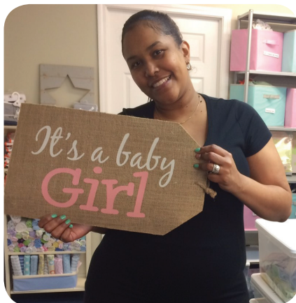
One of the joy-filled moms who chose life in 2017!

Last year, we created a text-based system to follow up with our clients throughout their pregnancies, answer any questions and offer emotional support. Through this follow-up, we confirmed that 68 of the moms in our program continued their pregnancies and chose life for their babies!