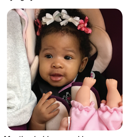
Meeting babies saved by your prayers and support: priceless.

Our thanks to the Knights of Columbus Council #5436 for donating over $1,000 from their pancake breakfasts to support mothers and fathers in saying "yes" to life!