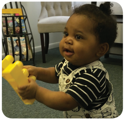
This one-year-old toddler's mother is so in love and can't imagine life without her sweet little guy.

On another day, we had a visit from a young mom and her toddler. This mom had also come to us determined to have an abortion. She was facing immense pressure from her ex-boy-friend to end her pregnancy while also suffering from some difficult health issues. Despite all of her obstacles, she made the brave decision to continue her pregnancy. Her little boy is now a year old, and she shared with us how thankful she is for him!