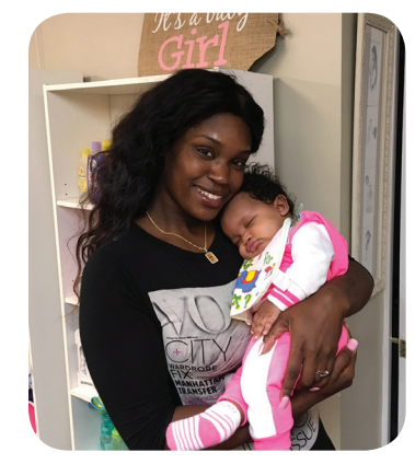
A recent visit from one of our joyful moms who chose life for her baby.

And to our further delight, she added: "Anytime I meet a woman who is considering abortion, I am going to send her to you!"