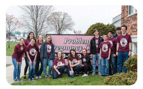
For "Be the Difference Day" in April, 15 Bishop Foley High School students provided lots of spring clean-up and baby boutique assistance.

We love to have members of our community stop by and see first-hand how their support saves lives, or lend a hand (or many hands)!