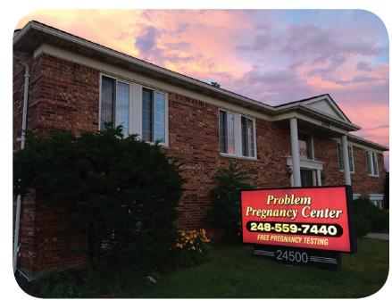
Beacon of hope: Our sign brings in occasional walk-in clients.

Although many women find us online, occasionally, there are those who drive by and see the large, pink sign outside of our building.