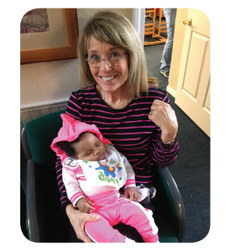
Our peer counselors love to meet and cuddle with babies saved from abortion.

Our heartfelt appreciation goes out to every individual, school group, church and Knights of Columbus council for the lifesaving difference you are making here at the center.